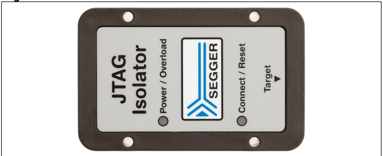
Figure 1. JTAG Isolator

Both sides, target and emulator, are fully isolated. The JTAG Isolator is powered fully from pin 19 of the emulator side connector.